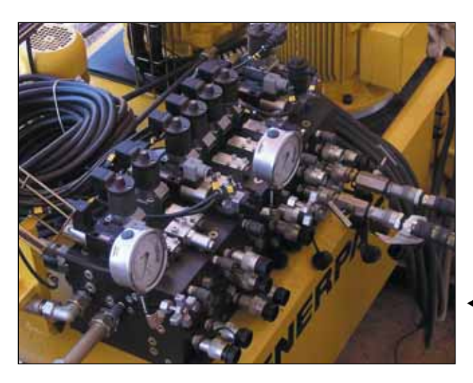
A typical multi-cylinder control set-up using solenoid directional control valves.