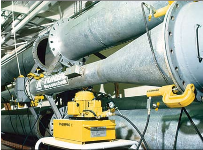
▲ A perfect example of the force and versatility of the Enerpac A-220 C-Clamp press.